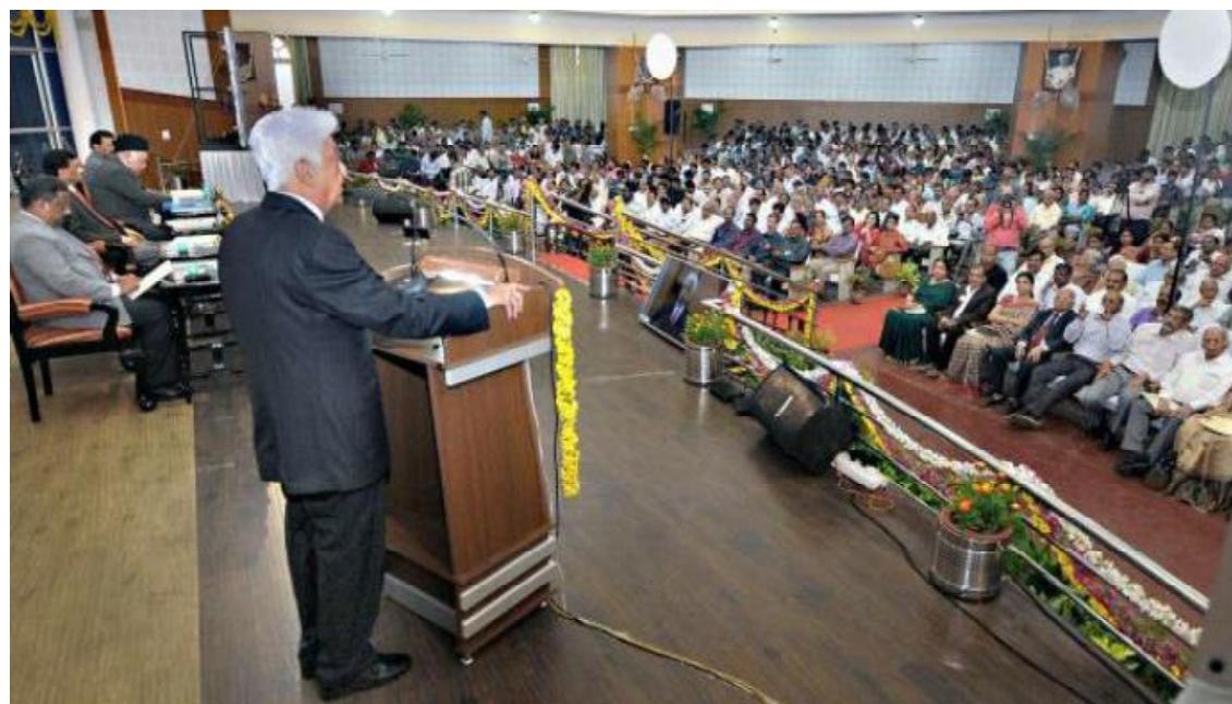
wipro chairman addressing the gathering about education system in the dias

Wipro Chairman Azim Premji addressing the gathering at University of Mysore. The public education has